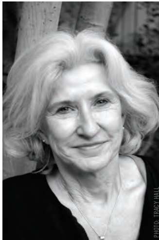
C.D. Wright, Brown University

“Wright has found a way to wed fragments of an iconic America to a luminously strange idiom, eerie as a tin whistle.”